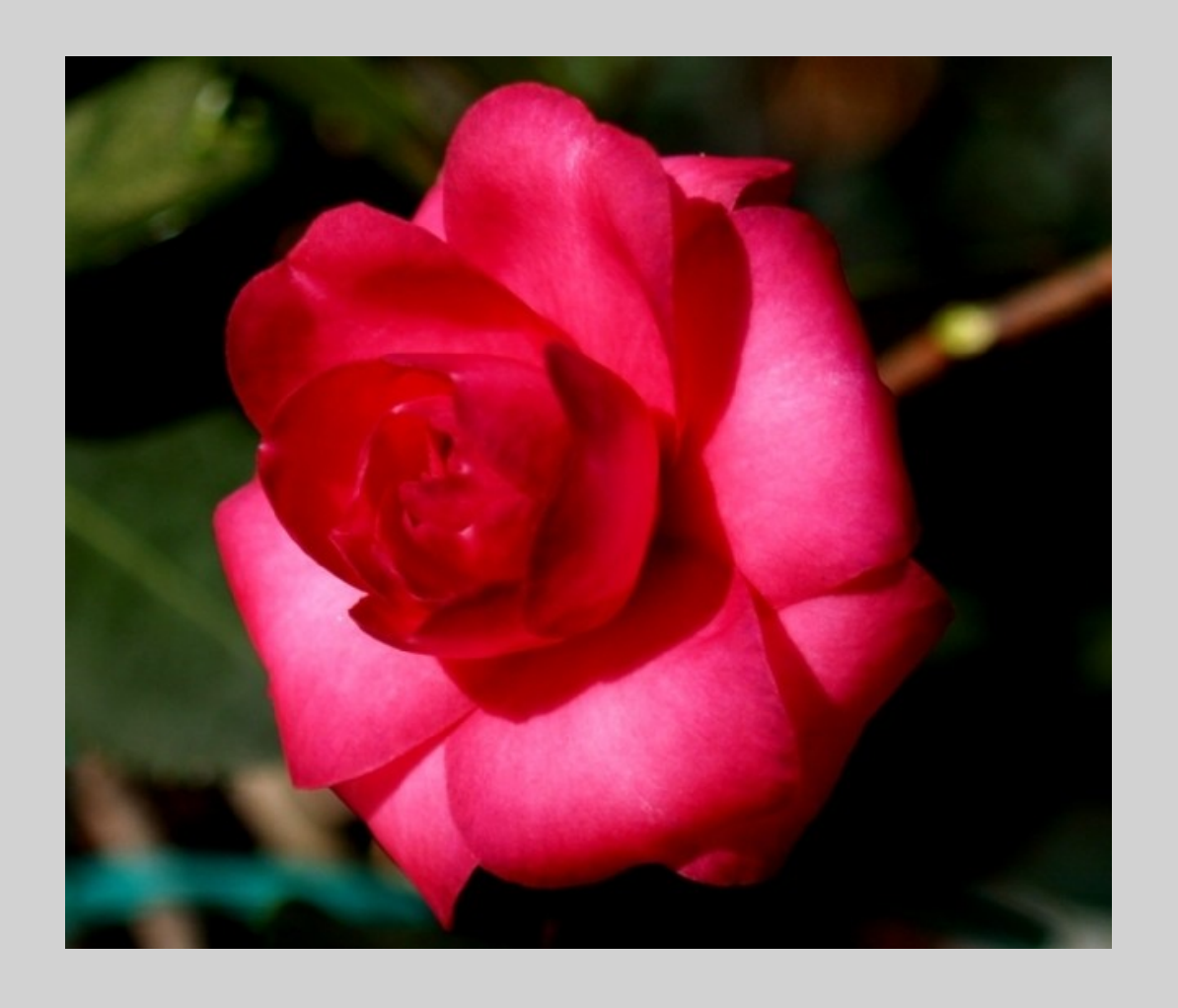
Camellia Midnight Ruby

Tiny camellia sasanqua Midnight Ruby is a VERY slow grower with a lot of punch. An excellent addition to your garden and a consistent show winner!