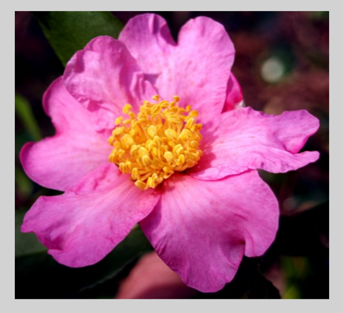
Camellia Winter's Star

Camellia sasanqua Winter's Star is another "series" registration. This medium bloom was designated by the Ag Center at Louisiana State University as a Super Plant in 2015.