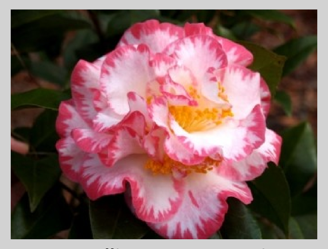
Camellia Margaret Davis

Camellia japonica Margaret Davis is a popular cultivar and normally a midseason bloomer. It does come early with moderate temperatures. It is cold tolerant and a consistent bloomer.