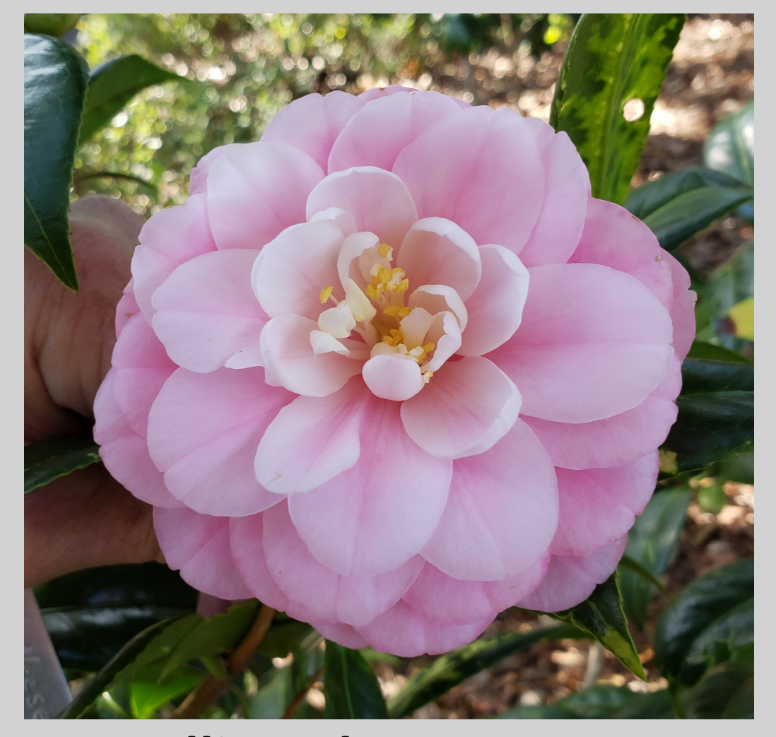
Camellia Robert McNeese

Camellia japonica Robert McNeese is a small soft pink formal double that was registered in 1974.