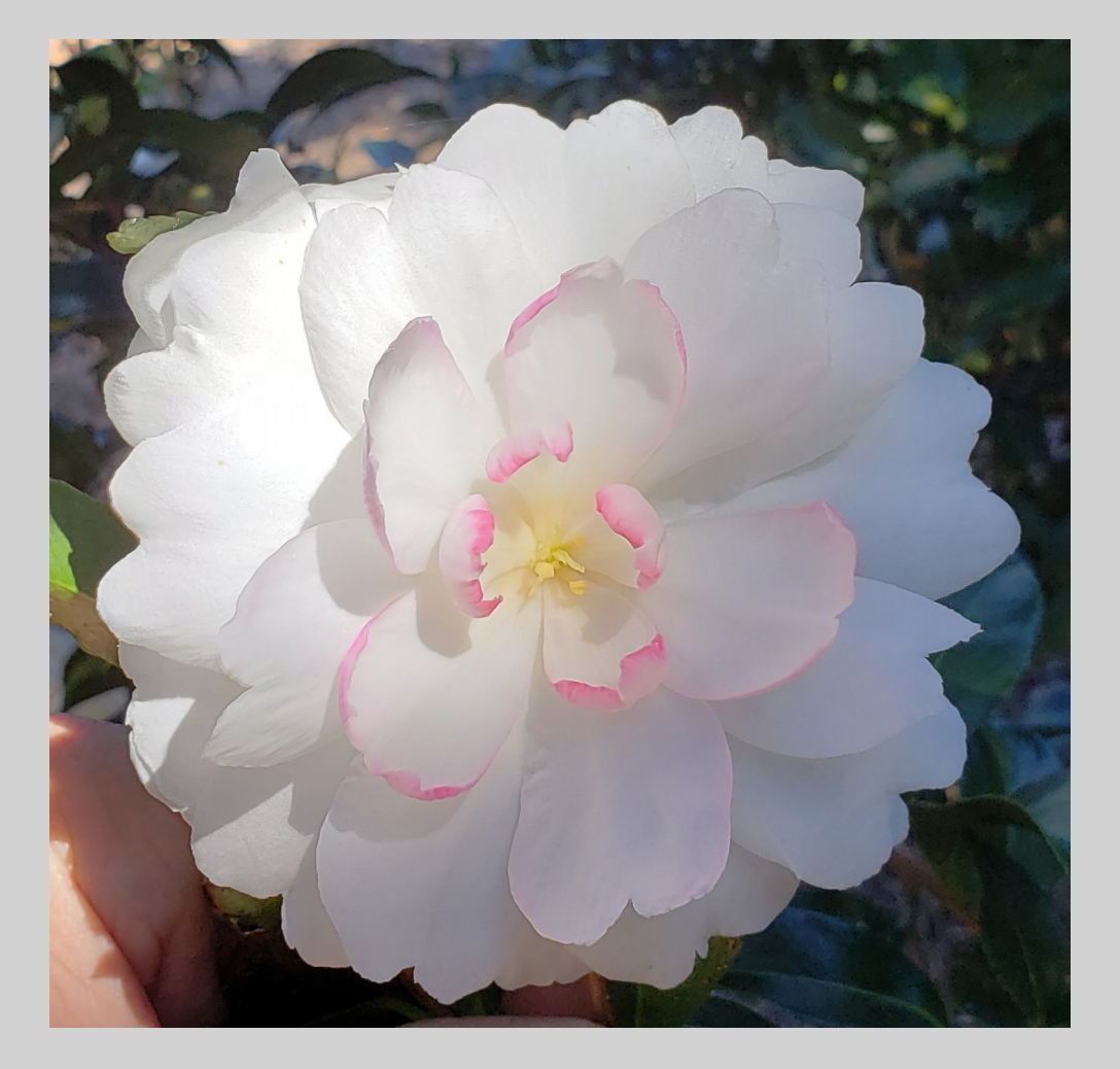
Camellia Eskimo Dawn

Camellia sasanqua Eskimo Dawn may be all white but often has striking pink accents. Profuse blooms are 3-4 inch.