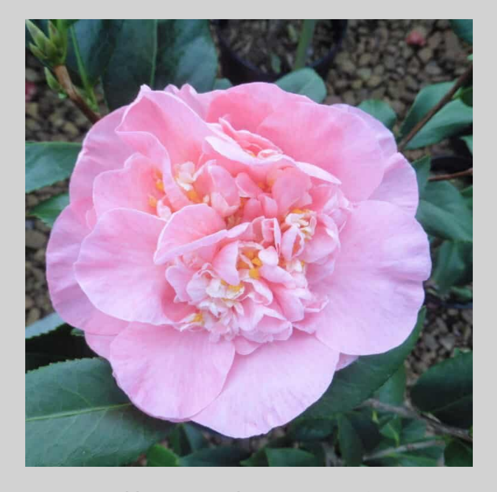
Camellia Delores Edwards

Camellia japonica hybrid Delores Edwards is a large semi double to anemone bloom form with an upright spreading growth habit.