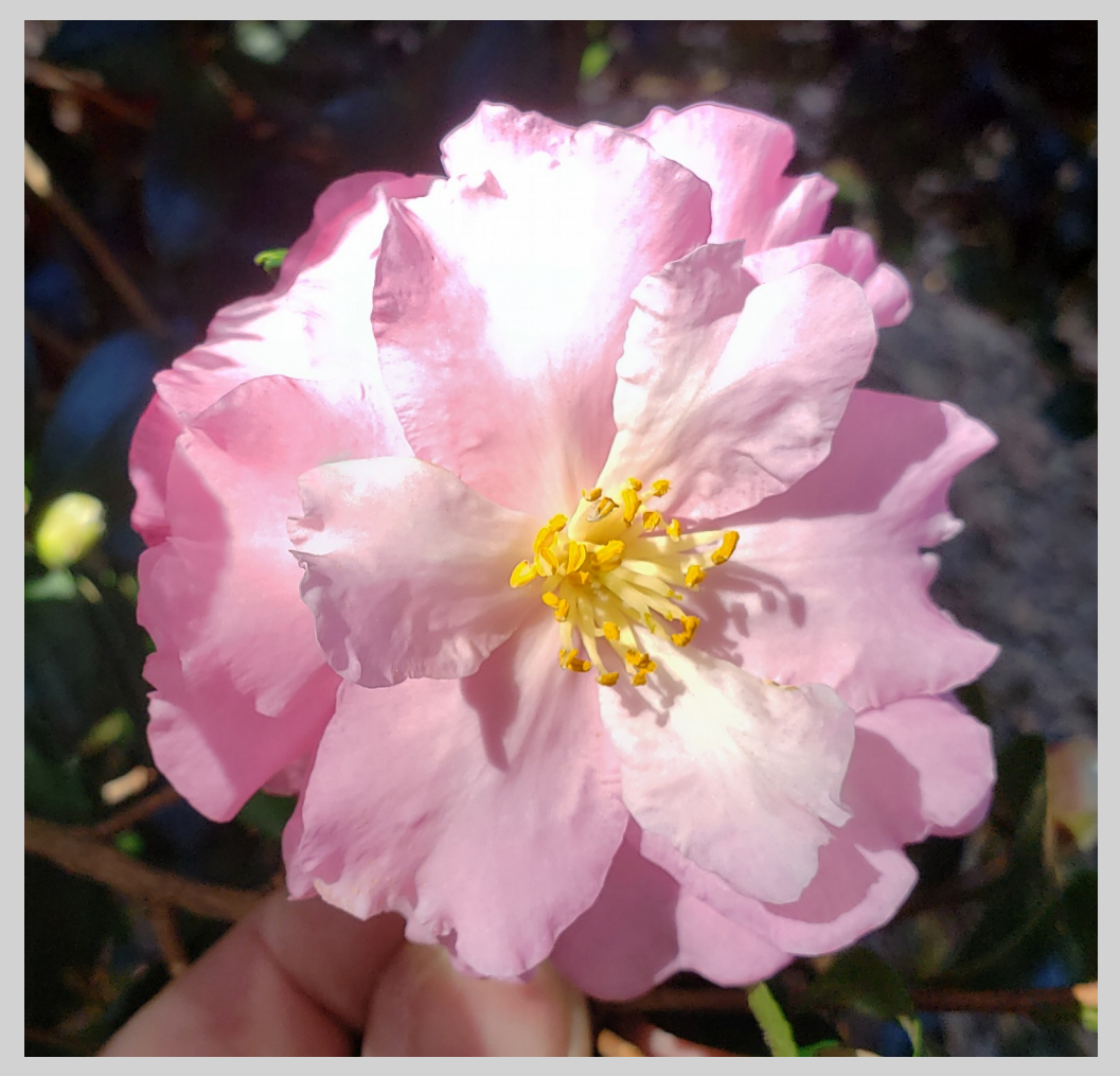
Camellia Our Linda

Camellia sasanqua Our Linda does well in full sun and is a medium size bloom. Its dense dark green foliage makes a good screen or specimen in the garden.