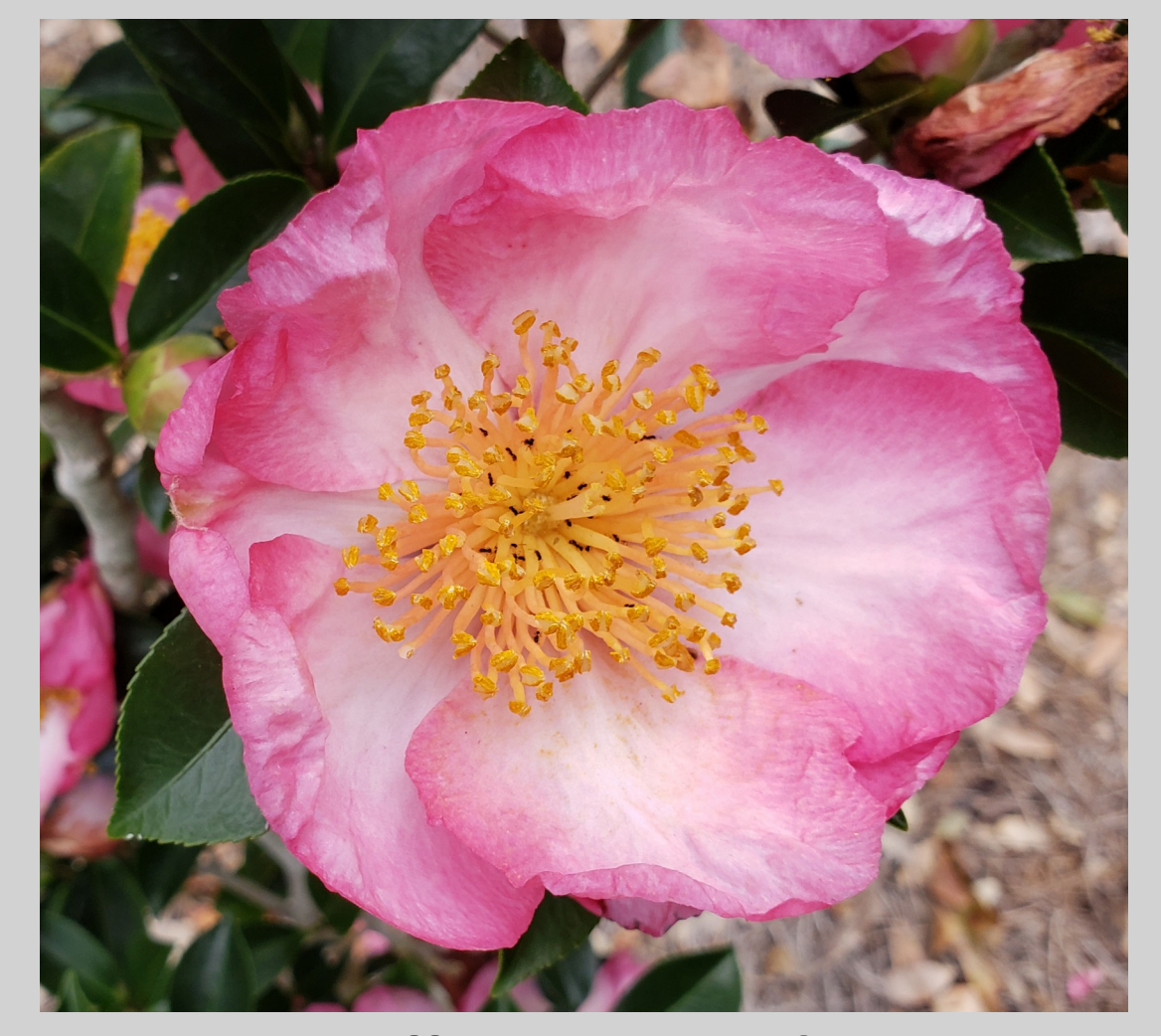
Camellia Painted Desert

Camellia sasanqua Painted Desert has large flowers with petals that are white with deep rose red border. This cultivar is a profuse bloomer.