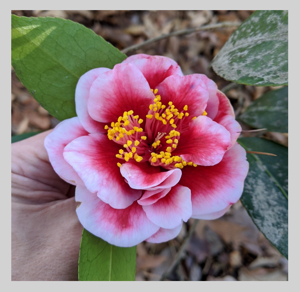
Camellia Tama Vino

Camellia japonica Tama Vino is another early bloomer in the Tama series and it is a seedling of Tama-no-ura.