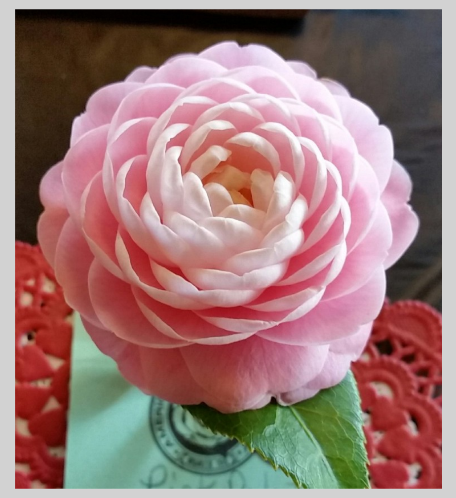
Camellia Pink Perfection

The old southern garden favorite camellia japonica Pink Perfection blooms early to late in the season. Blooms are a small perfect formal double form that sometimes swirls. Growth is vigorous & upright.