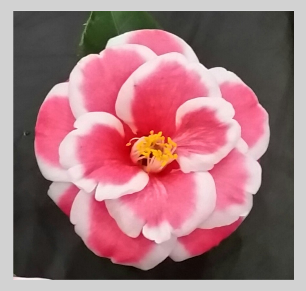
Camellia Tama Americana

Camellia japonica Tama Americana blooms early through late season. The entire Tama camellia collection are all early bloomers. This is a great garden addition.