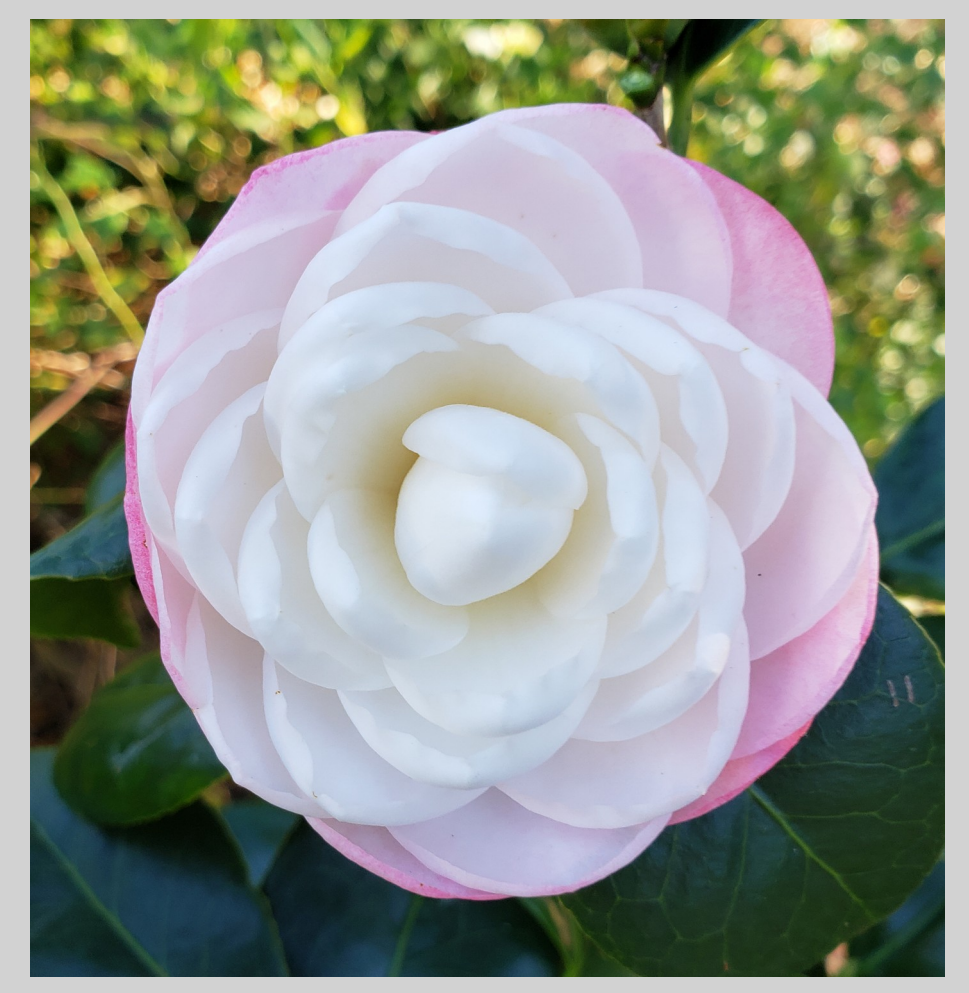
Camellia October Affair

Pretty camellia October Affair is a small japonica related to japonica Berenice Boddy and Berenice Beauty. All are early bloomers.