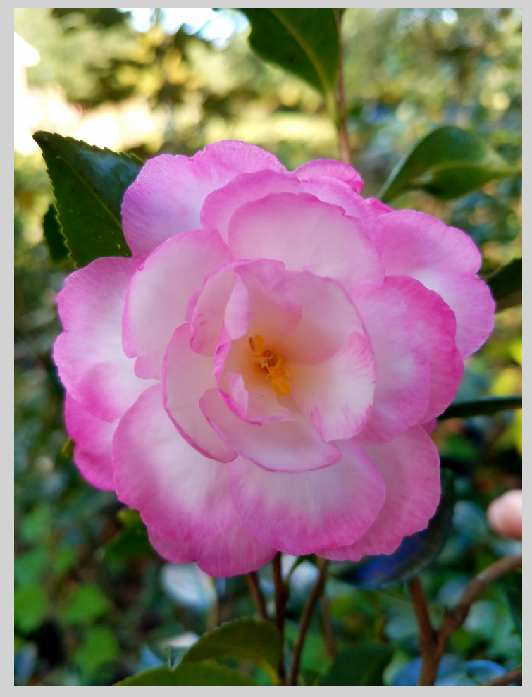
Camellia Leslie Ann

Camellia sasanqua Leslie Ann is known for its abundance of white blooms with pink edges and yellow centers appearing from fall through December. It has dark green glossy foliage and is a great foundation plant due to its dwarf growth.