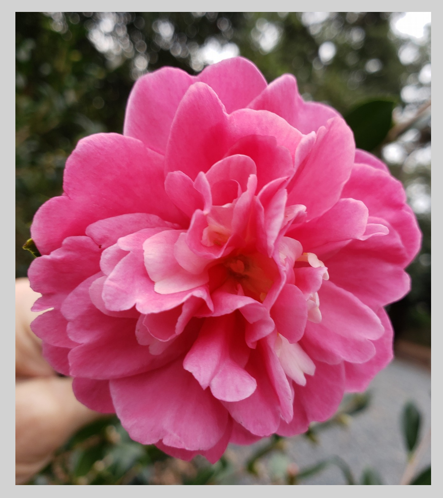
Camellia Autumn Spirit

Autumn Spirit is one of many in the Autumn camellia sasanqua hybrid series. All are heavy bloomers and do well in sun or shade.