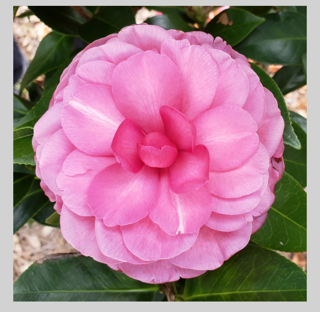
Camellia Early Autumn

Camellia japonica Early Autumn has rose colored formal double flowers. The very dark blue-green dense foliage creates a beautiful display. It can create a colorful evergreen hedge or screen.