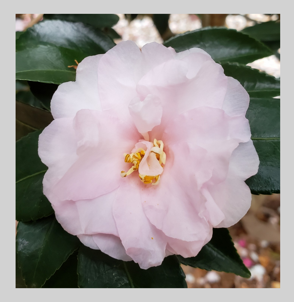
Camellia Jean May

Jean May sasanqua is a delicate pale pink and a heavy bloomer. Leaves are dark green and the plant is an excellent choice for a hedge or espalier.