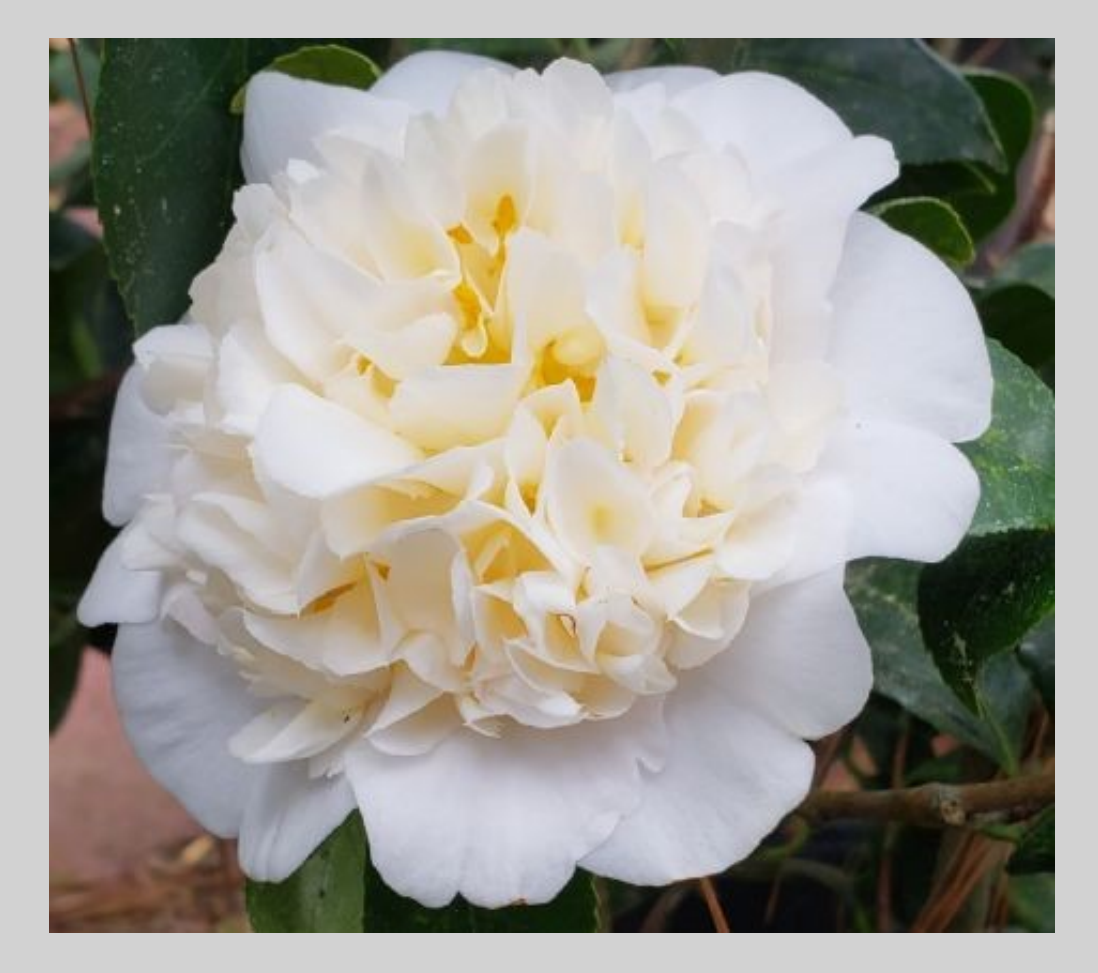
Camellia Jury's Yellow

Jury's Yellow is a williamsii hybrid with medium sized anemone flowers. The row of white outer petals with pale yellow center petaloids interspersed with golden stamens help to create the yellow effect.